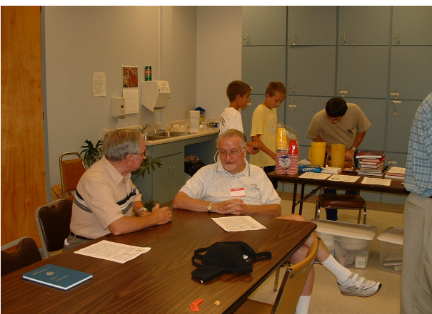
Members passing knowledge and swapping stories