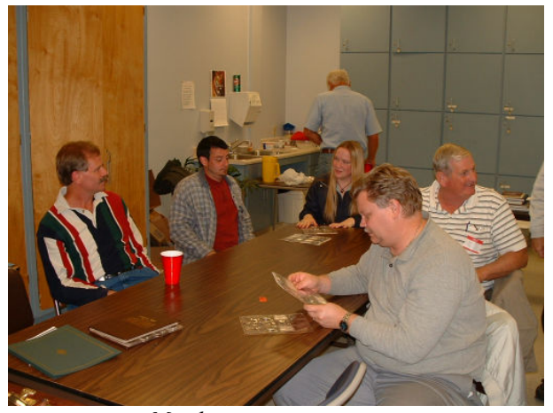
Members swapping stories