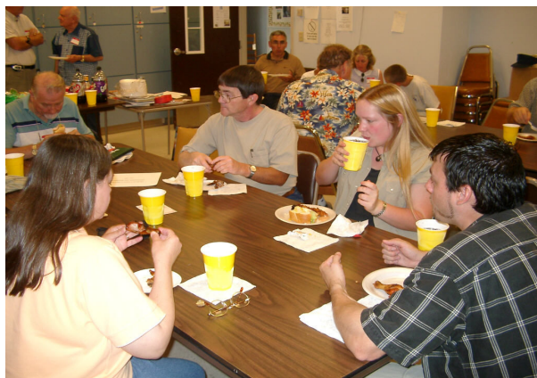
In June members enjoying the pot luck